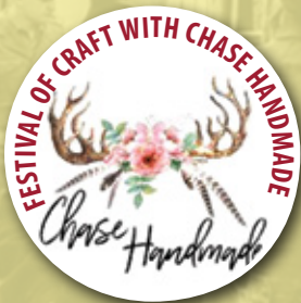
FESTIVAL OF CRAFT July 4th & 5th