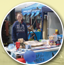
CHARITIES DAY August 23rd