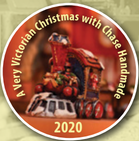
CHRISTMAS MARKET November 29th