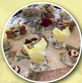
MOTHERS DAY March 22nd