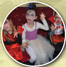
HALLOWEEN October 30th & 31st