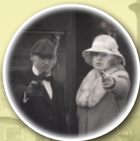
FLAPPERS & FLAT CAPS August 15th & 16th