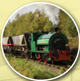
PITS TO POWER STATIONS GALA April 4th & 5th