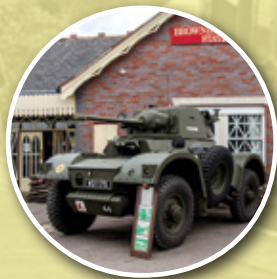
1940'S WEEKEND June 20th & 21st